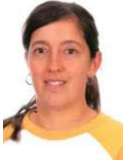
Miss Houston Wraparound Care